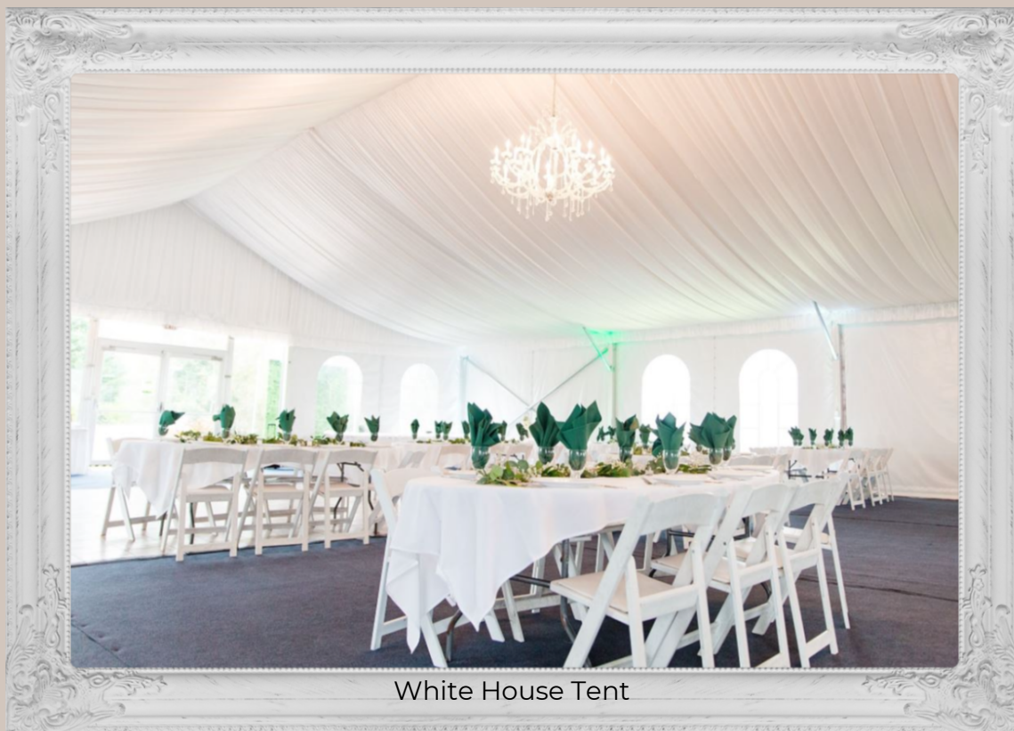
White House Tent